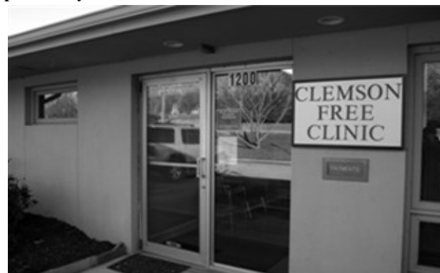
Every $1 donated to a South Carolina Free Clinic provides a minimum of $5 worth of healthcare services.

Source: National Association of Free and Charitable Clinics, 2019.