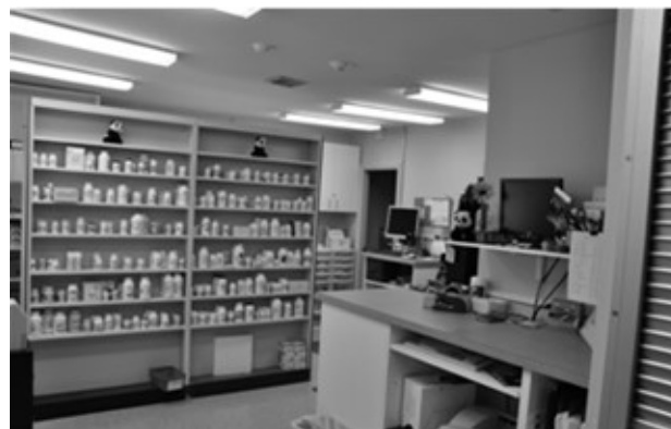
The Clemson Free Clinic filled 3,012 prescriptions in our pharmacy in 2019.

$25.00 $250.00 $50.00 $500.00 $75.00 $1000.00 $100.00 Other $ _____