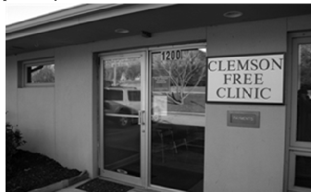
Every $1 donated to a South Carolina Free Clinic provides a minimum of $5 worth of healthcare services.

Source: National Association of Free and Charitable Clinics, 2018.